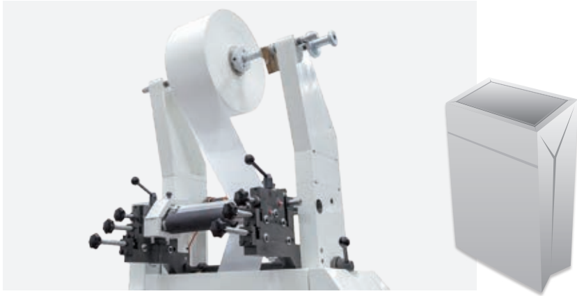
Bottom patch unit