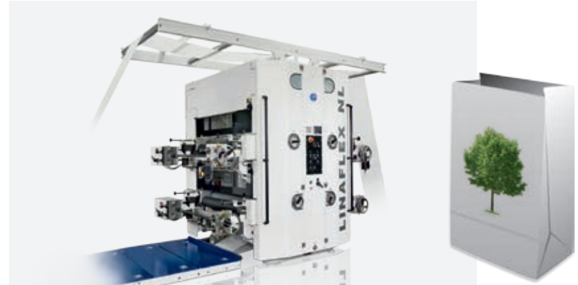
Inline printer LINAFLIX NL