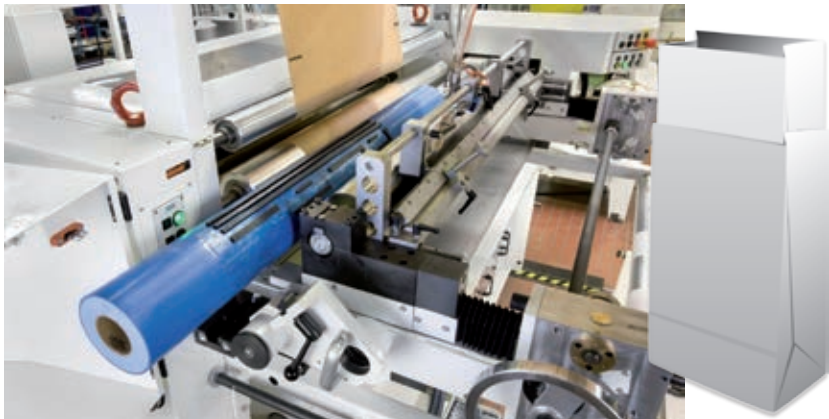
Feeding unit/cross pasting