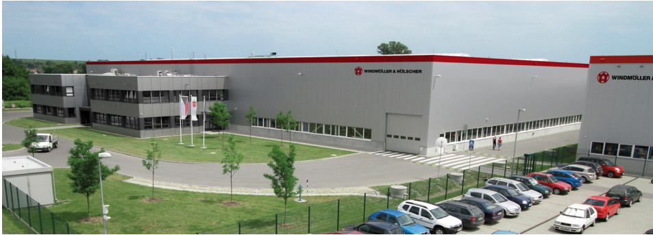
Factory in Czech Republic