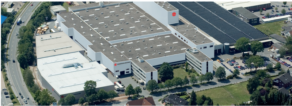
W&H Headquarters in Germany