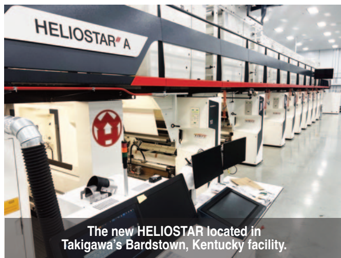
The new HELIOSTAR located in Takigawa's Bardstown, Kentucky facility.