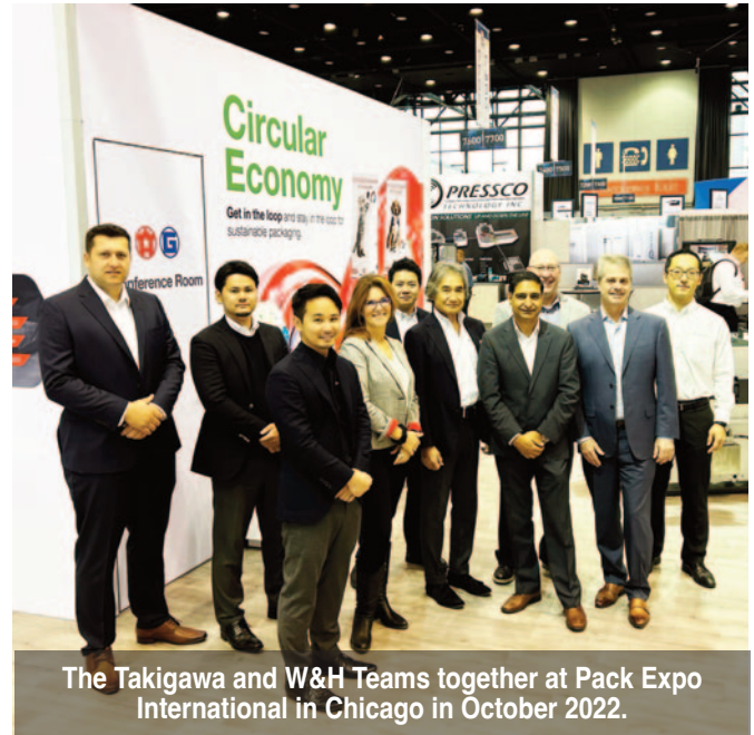
The Takigawa and W&H Teams together at Pack Expo International in Chicago in October 2022.

Efficient Production | Circular Economy | Digitization