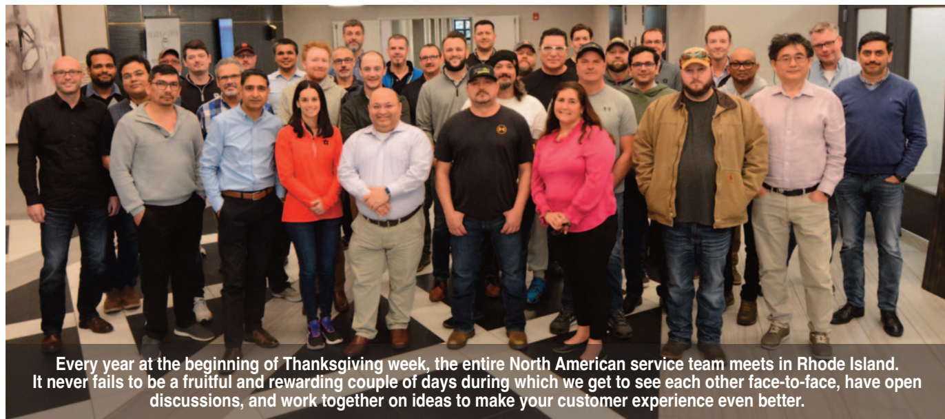
Every year at the beginning of Thanksgiving week, the entire North American service team meets in Rhode Island. It never fails to be a fruitful and rewarding couple of days during which we get to see each other face-to-face, have open discussions, and work together on ideas to make your customer experience even better.