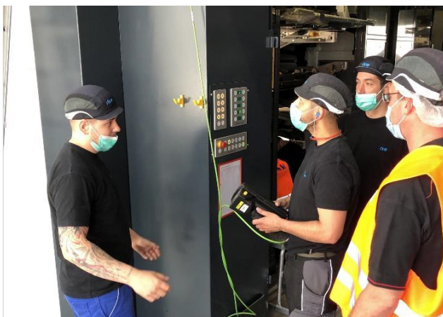
Implementation of the optimizations to the new VISTAFLEX CL 8

Management approach and W&H for production optimization. As a result, a further process consulting has already been booked for another machine in order to increase the productivity in the long term. We are looking forward to supporting our customer with our expertise in the next projects.