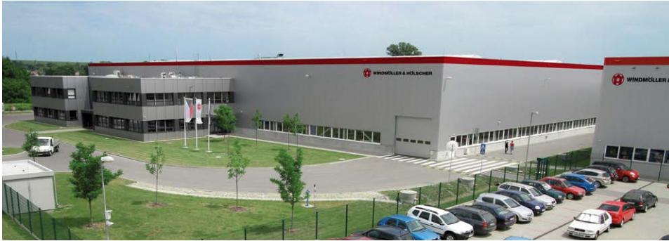
Factory in Czech Republic