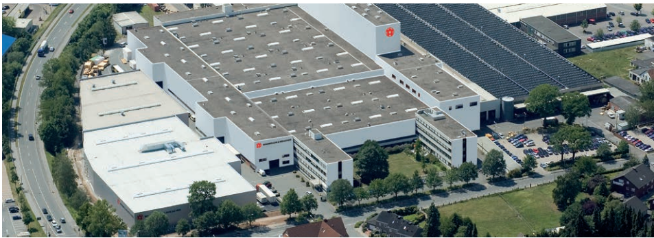
W&H Headquarters in Germany