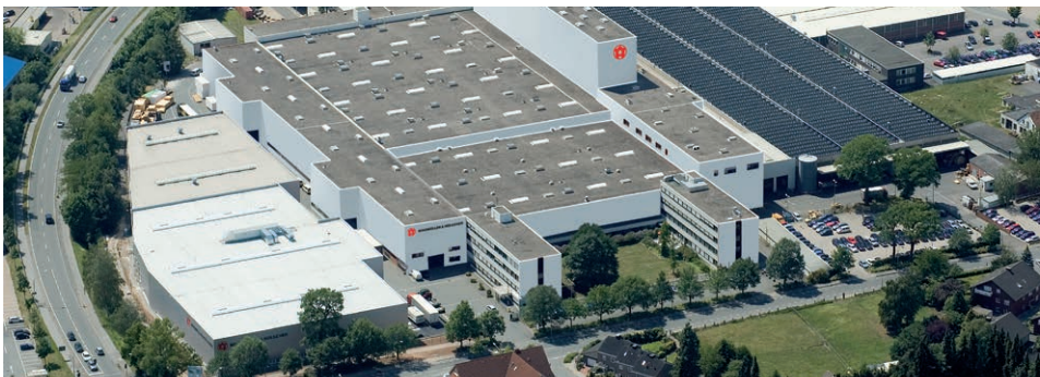
W&H Headquarters in Germany