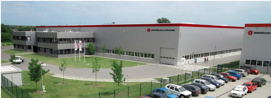
Factory in Czech Republic